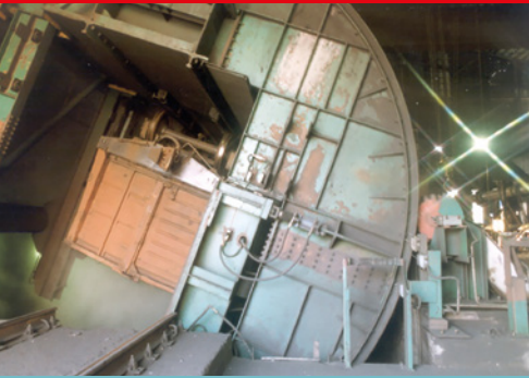
Unloading of a coal waggon