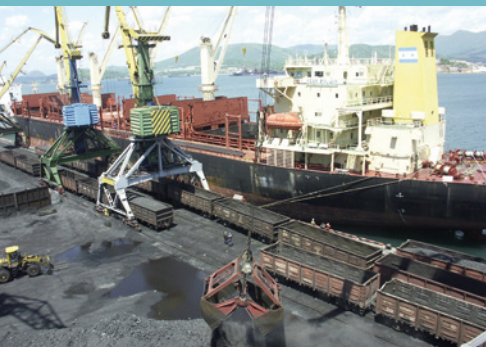
Loading of coal onto ships